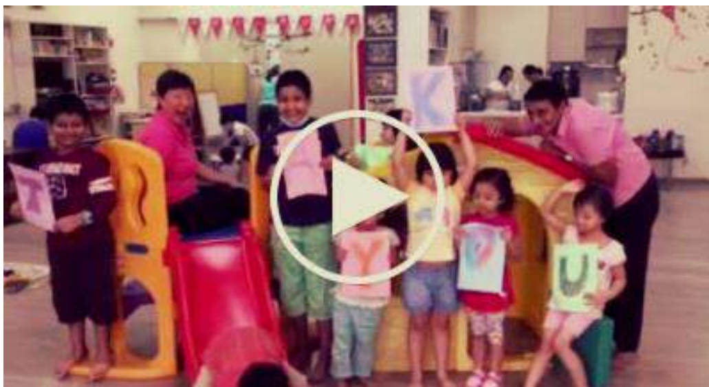
CHI Video: A Thank You From Arc Children's Centre!

We wish Arc well and look forward to continuing our partnership towards the future!